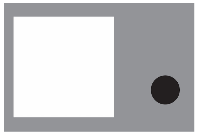
Figure 1: Diagram showing Whiteness' perceived position with Blackness. Blackness sits outside of Whiteness..

Simultaneous with the establishment of race as a category of scientific inquiry, philosophers would also provide their own racially-based rationalization for White European superiority. In his aesthetic treatise Immanuel Kant—the German philosopher credited with helping to found modern philosophical thought—referred to the black man as insignificant and subhuman.<sup>10</sup> His successor, German philosopher Georg Wilhelm Friedrich Hegel would state that Africa had no significance to the history of man and had no value.<sup>11</sup> He would describe its people as amoral and soulless. Out of these belief systems the social construct of whiteness emerges.<sup>12</sup>